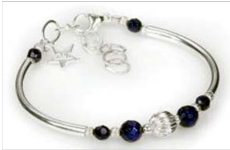
Hand Crafted Cape Cod Nights Bracelet

By carrying these new things, I became drawn to learn more about them. I love to learn and I love to teach, both attributes learned from nursing.