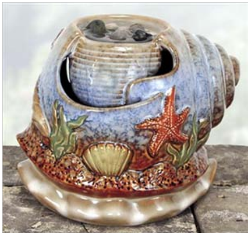
Seashell Shaped Fountain

Last year, when the economy dropped, the store became even more of a challenge. My wonderful customers, struggling with their own lives, could not afford their necessities. Gifts are not necessities.