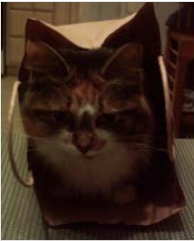
Even Soukie had her cute moments

weird, however, that she never tried to harm our pet rabbit. In fact, they would hang out on the couch and watch TV together.