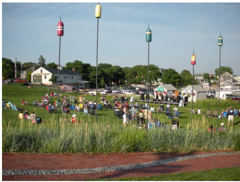
An audience enjoys the FREE HyArts Summer Concert Series at Aselton Park, in Hyannis