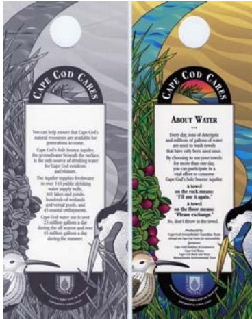
Water Use Reminder for Towel Racks encourages hotel guests to reuse their towels