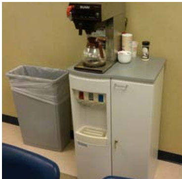
Instead of providing bottled water, the Cape Cod Five Cents Savings Bank has filtered water tanks in each of their branches